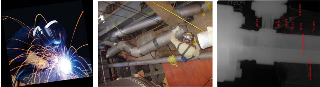
Pictures: Different BHDT Service activities such as installation services (left and middle) and corrosion inspection services (right).

The figure above shows that during the life time of a urea plant each of these services can and will become necessary. BHDT Service offers all these services; BHDT Service is the One Stop Solution provider for all your High Pressure Piping issues.